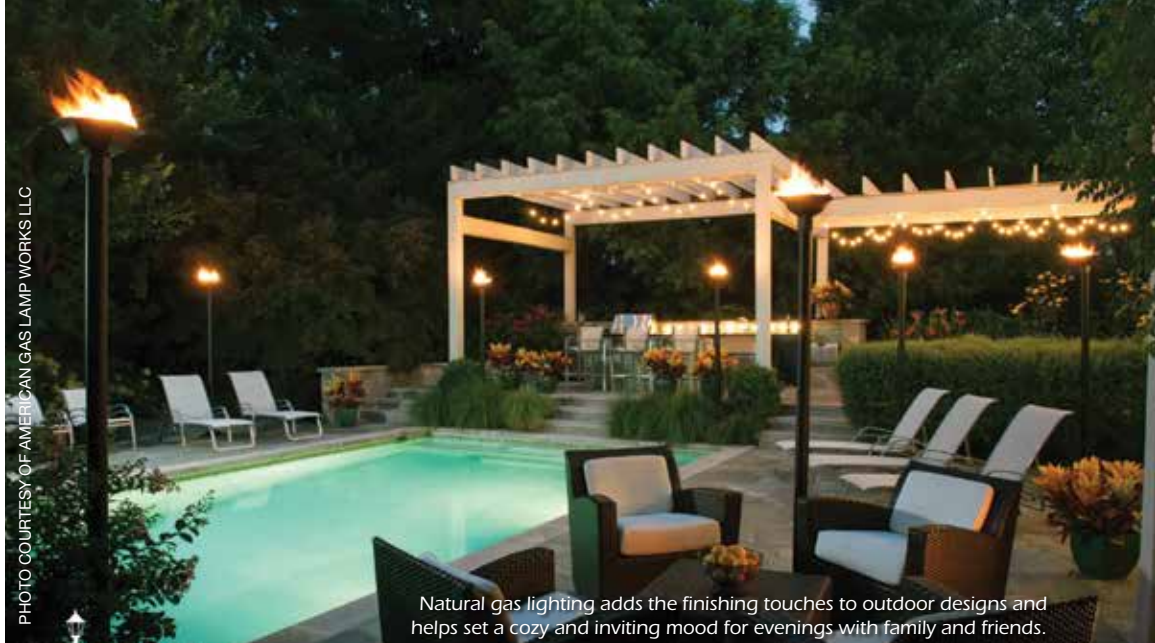
Natural gas lighting adds the finishing touches to outdoor designs and helps set a cozy and inviting mood for evenings with family and friends.