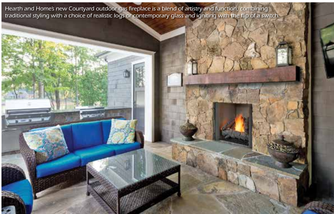
Hearth and Home's new Courtyard outdoor gas fireplace is a blend of artistry and function, combining traditional styling with a choice of realistic logs or contemporary glass and igniting with the flip of a switch.