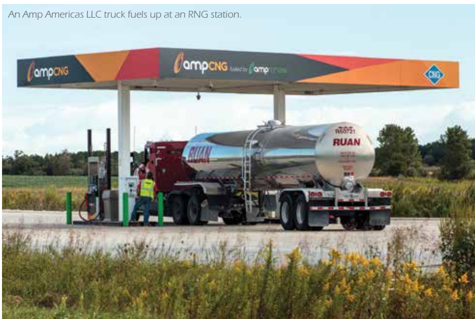
An Amp Americas LLC truck fuels up at an RNG station.

Additionally, a new state law mandates only renewable and zero-carbon resources be used for electricity generation by 2045. Another law known as Senate Bill (SB) 1440 requires the state's Public Utilities Commission and Air Resources Board to consider adopting RNG procurement targets for gas companies in the state. In other words, a portion of all the gas consumed by residential and commercial customers would have to be RNG.