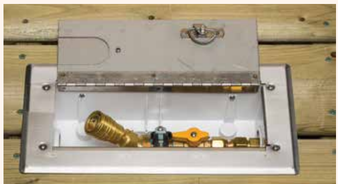
Burnaby Manufacturing Ltd.'s Wood Deck Versatile Gas Plug™ offers easy plug-in convenience for natural gas appliances while concealing unsightly pipes and valves.

Convenience outlets come with a variety of safety features. They automatically shut off if the temperature reaches 250 degrees and most require that the manual valve be shut off before the appliance is connected or disconnected. ■