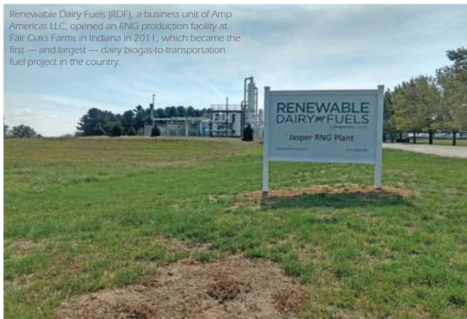
Renewable Dairy Fuels (RDF), a business unit of Amp Americas LLC, opened an RNG production facility at Fair Oaks Farms in Indiana in 2011, which became the first — and largest — dairy biogas-to-transportation fuel project in the country.