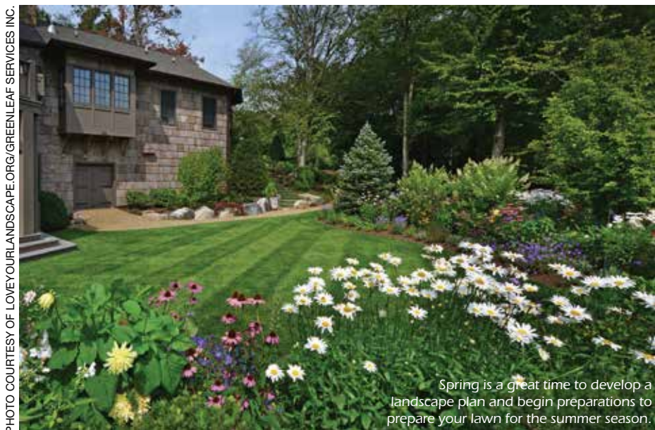
Spring is a great time to develop a landscape plan and begin preparations to prepare your lawn for the summer season.

For more tips on creating healthy lawns and landscapes or to find a local landscape professional, visit LoveYourLandscape.org . ■